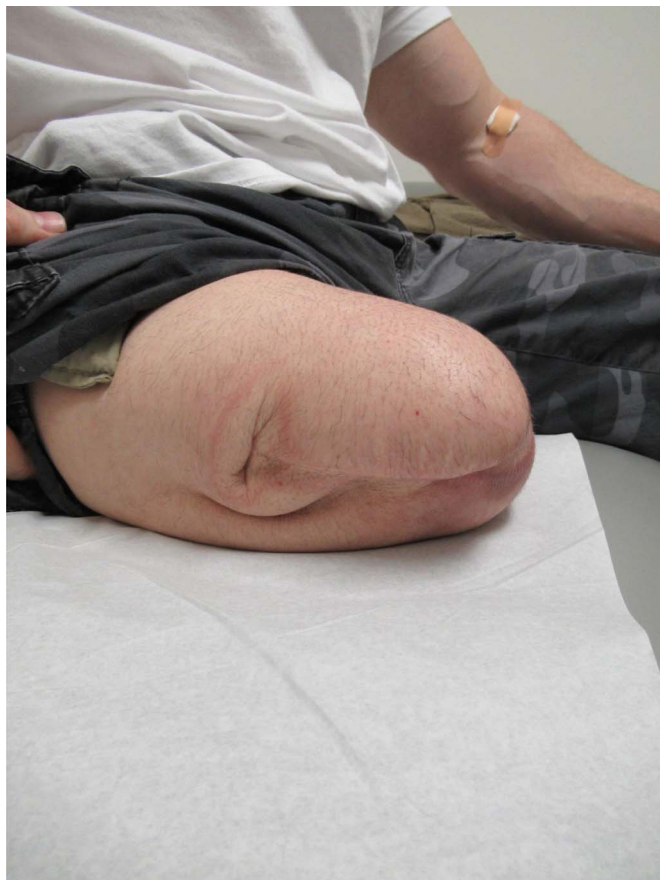
FIGURE 1. Scars and soft tissue redundancy of preoperative extremity. full color online

The principal goals of soft tissue reconstruction around the osseointegrated implant are relief of soft tissue redundancy and formation of a tight seal around the stoma. Preoperatively, the soft tissue