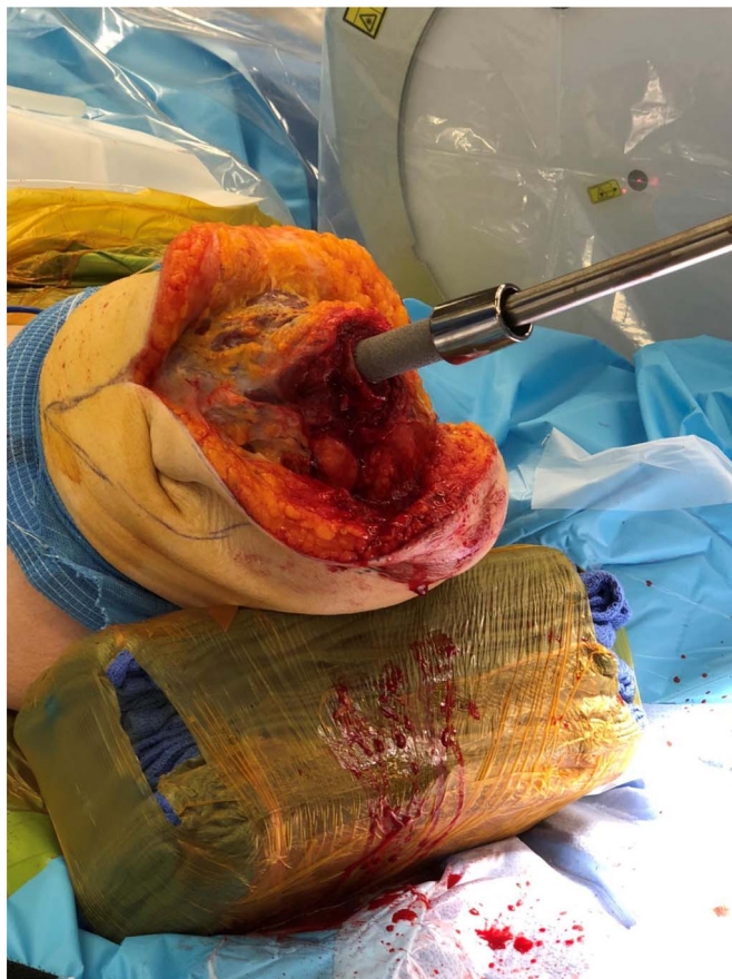
FIGURE 2. Implantation of osseointegrated prosthesis. full color online

envelope is evaluated for areas of redundancy and prior scars, and incisions are planned with the orthopedic surgery team (Fig. 1). A “fish-mouth” incision pattern is planned with a posterior skin flap that has enough length to provide an adequate skin bridge between ultimate position of the stoma and the incision.