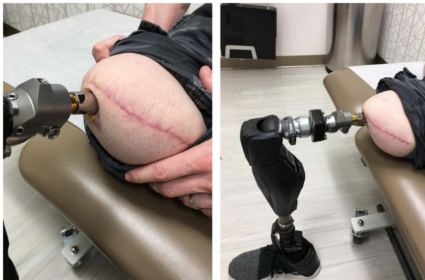
FIGURE 5. Typical appearance at postoperative follow-up visit. full color online

refashioning. 15 The historically high rates of reoperation emphasize both the challenge and importance of the soft tissues for a successful reconstruction. An excessive skin envelope interferes with the prosthesis and leads to impingement, irritation, and shear forces that can compromise the viability of the soft tissues. Furthermore, the tissues will inevitably loosen and stretch as the patient ages. For this reason, we routinely extend the incision up the medial and lateral aspects of the limb to reduce the skin envelope dramatically at the time of implant placement. The surgeries described in this article allow for a 1-stage approach to soft tissue contouring and placement of an osseointegrated implant. Patients who present with a paucity of soft tissue or skin graft over an extremity stump do well with a percutaneous placement of the implant without any soft tissue recruitment, which underscores the importance of creating a tight, thin coverage of the implant bone interface. Our early results are encouraging, as there were no required soft tissue revisions to date.