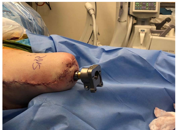
FIGURE 4. Immediate result after closure of soft tissues. full color online

The most common cause for reoperation in this patient population is the fit and viability of the soft tissues. An early series reports approximately 38% rate of revisional surgery for problems at the stoma, with 2 patients requiring implant removal after chronic soft tissue problems at the dermal interface. 19 A follow-up study from the same group showed that the initial cohort had increased to a 77% rate of soft tissue-related reoperation but that, after advances in implant design and modification of technique, this dropped significantly. 20 A more recent series reports 6 (27%) of 22 patients requiring elective surgery for soft tissue