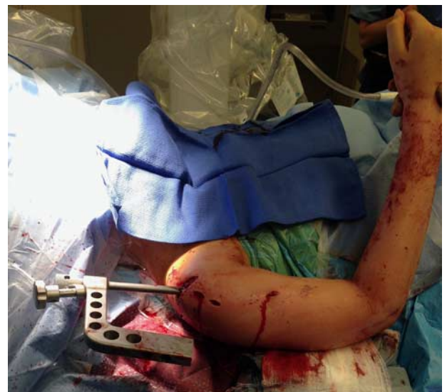
FIGURE 3. Intraoperative view of the arm after osteotomy, insertion of nail, and proximal locking.